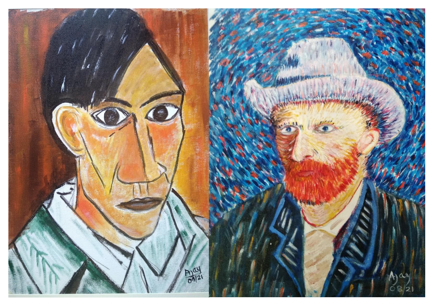
Self-Portrait - Pablo Picasso and Van Gogh