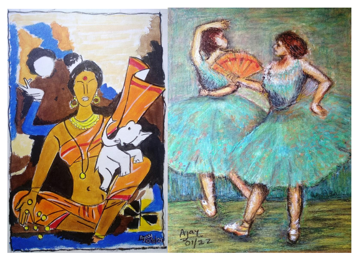
M F Husain – Parvati and Degas Blue Dancers

Online Digital Gallery: https://tinyurl.com/AJ-Digital-Art-Gallery