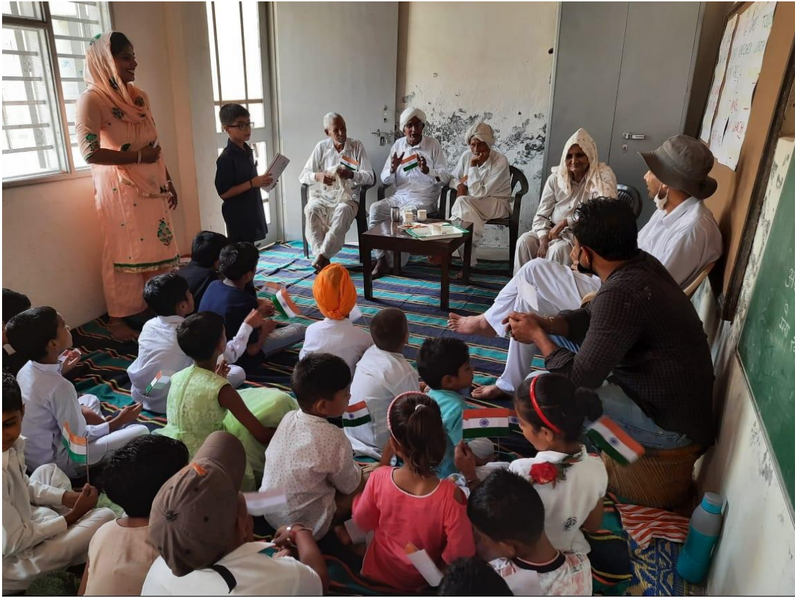
Independence Day celebration at the community school. The senior citizens of our village were invited as chief guests. They shared how life was before independence.