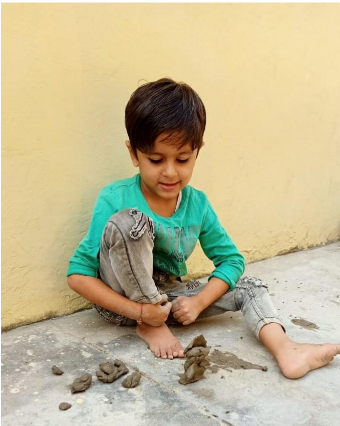
Learning by doing

The vision of the initiatives is to give a new direction to education in our country by demonstrating how community can take charge of educating its future generation and how education can be used as a process for bringing the desired change in society at a larger scale.