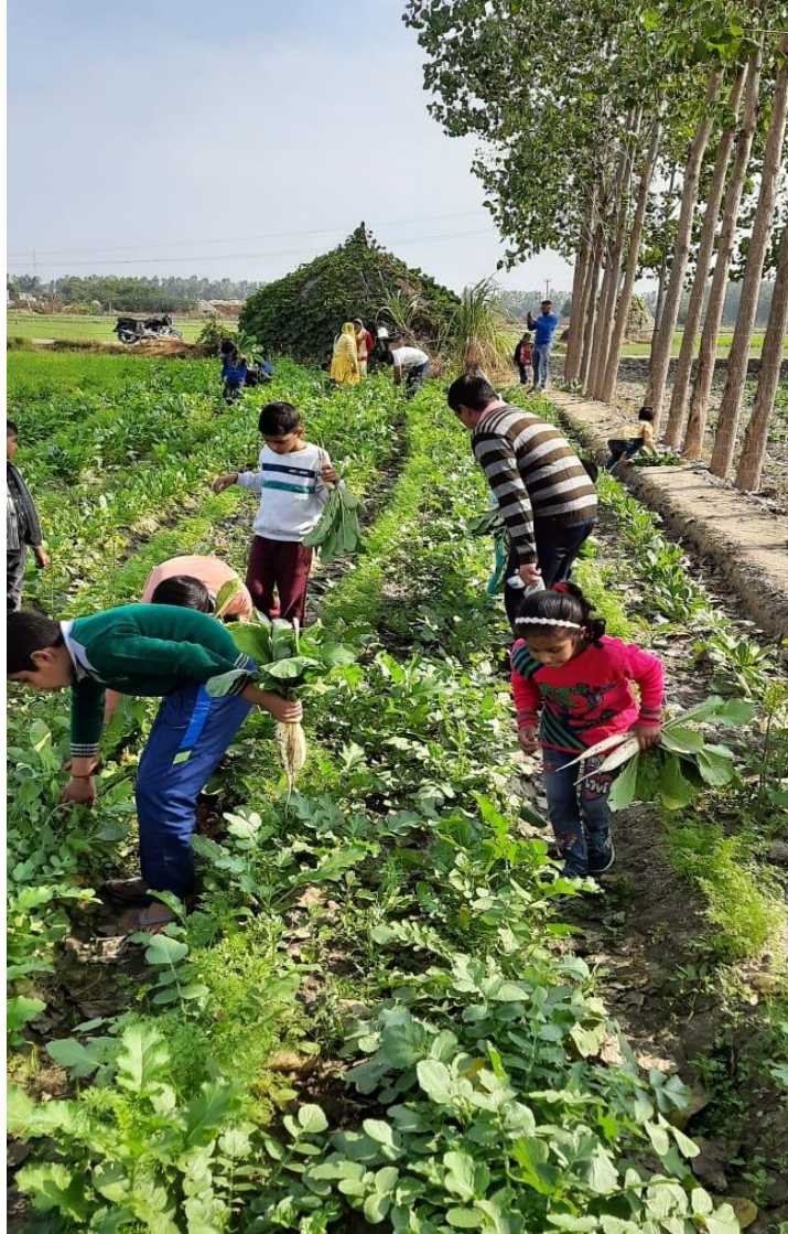
Students during the '4-months food and farming expedition' where they experience growing organic food and vegetables. Here, they have grown peas, carrot and radish with holistic learning.

DISHA INDIA COMMUNITY SCHOOL is an Experiential Learning school where we use real-life experiences from the local context of the child, as a pedagogic medium for teaching the required curriculum, skills and values. The idea is to demonstrate how a community can design its own education program based on its context, challenges, aspirations and possibilities, so that education is rooted in the local context and prepares children for a future that the community aspires for. At the school, the pedagogy is experiential, contextual and personalized. We use local experiences as pedagogic medium for developing the required knowledge, skills and values. The idea is to move from 'near to far' and from 'concrete to abstract'.