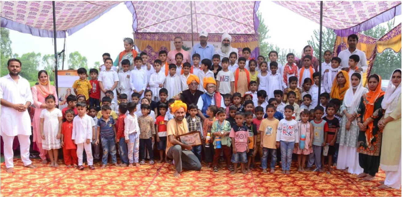
On Oct 2 2021, during the foundation stone-laying ceremony of the community school

Disha India Community School - based on the principles of Experiential Learning and Nai Talim