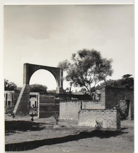
LEFT: Louis Kahn and BV Doshi at the NID campus TOP CENTRE: IIMA's first campus: Nirmala Balabhai Bungalow TOP RIGHT: The demonstration arches constructed by Louis Kahn BOTTOM CENTRE: Dormitories under construction, mid-1960s