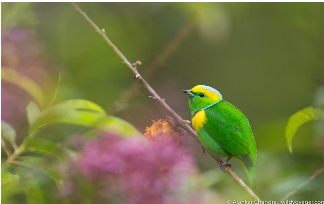
Golden Browed Chlorophonia

OTHER BIRDS AND REPTILES There are other bird families found like tanagers, trogons, vultures, macaws, and a host of reptile species.