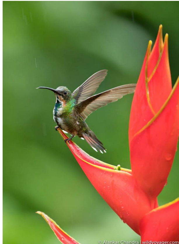
Green Breasted Mango

Hummingbirds are attracted to the country's abundant nectar-producing flowers and feeders, making it easy to observe and appreciate these tiny birds.