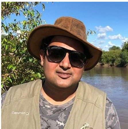
Cloud forests of Costa Rica