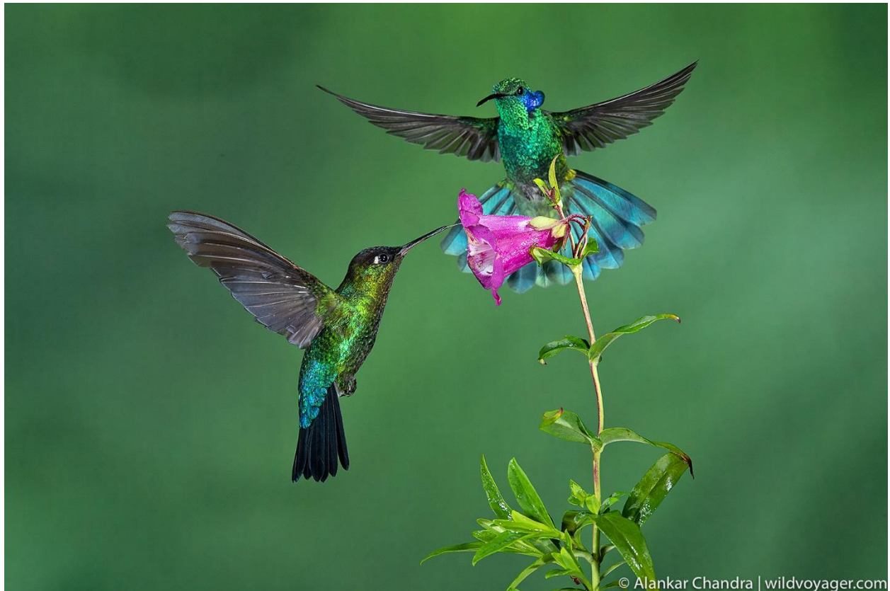
Fiery Throated Hummingbird (L) and Lesser Violetear (R)

OTHER BIRDS AND REPTILES There are other bird families found like tanagers, trogons, vultures, macaws, and a host of reptile species.